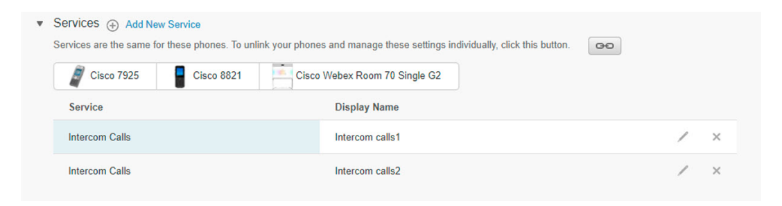
Figure 2: Linked Settings

The following graphic displays how a set of phones with unlinked Speed Dial Numbers settings appears in the user interface. Since the settings are unique for each phone, the Unlinked icon displays. You can click the icon to apply the same settings for all two phones.