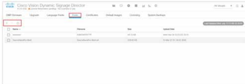
Figure 4 Fonts Tab