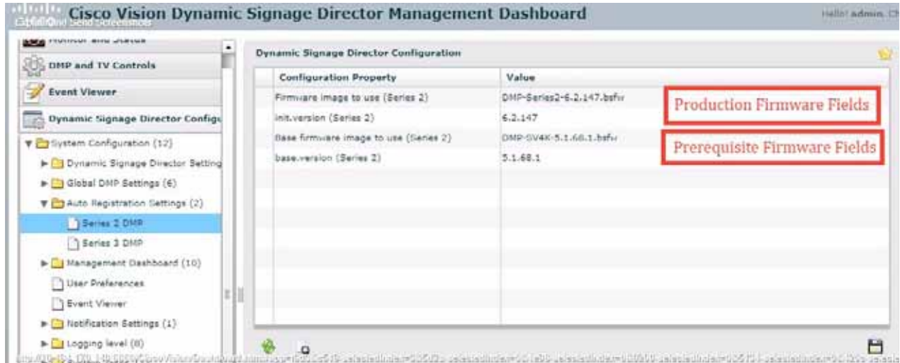
Table 2 Required Firmware Properties for the SV-4K and DMP-2K in Release 6.0