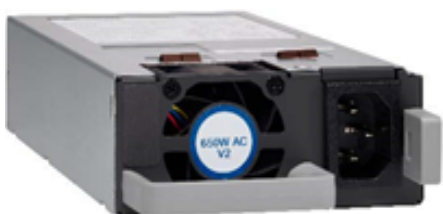
Figure 14. 650W AC power supply (C9K-PWR-650WAC-R)