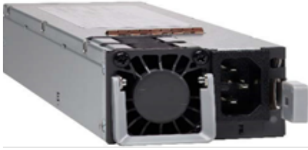
Figure 15. 1600W AC power supply