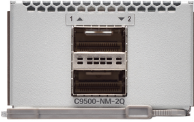
Figure 12. Cisco Catalyst 9500 Series network module 2-port 40 Gigabit Ethernet with QSFP+