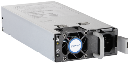
Figure 16. 650W AC power supply (C9K-PWR-650WACL-R)

Tables 9 and 10 provides more details on the Cisco Catalyst 9500X models power supplies.