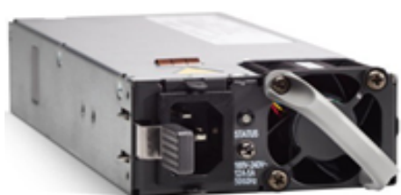
Figure 13. 950W AC power supply

Figures 13 to 16 show the power supplies available for the Cisco Catalyst 9500 Series