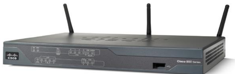
Figure 1. Cisco 861 Integrated Services Router with Integrated 802.11n Access Point