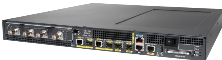
Figure 1. Cisco 7201

Benefits of the Cisco 7201 include the following (refer to Table 1 for details):