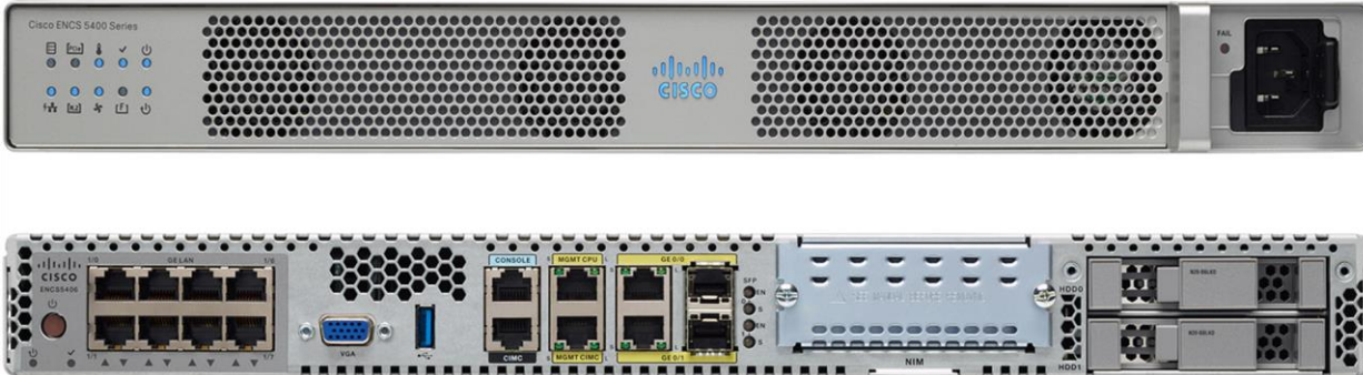
Figure 3. Cisco 5400 Enterprise Network Compute System - Front And Back

Figure 3 shows the front and back of the Cisco 5400 Enterprise Network Compute System platform.