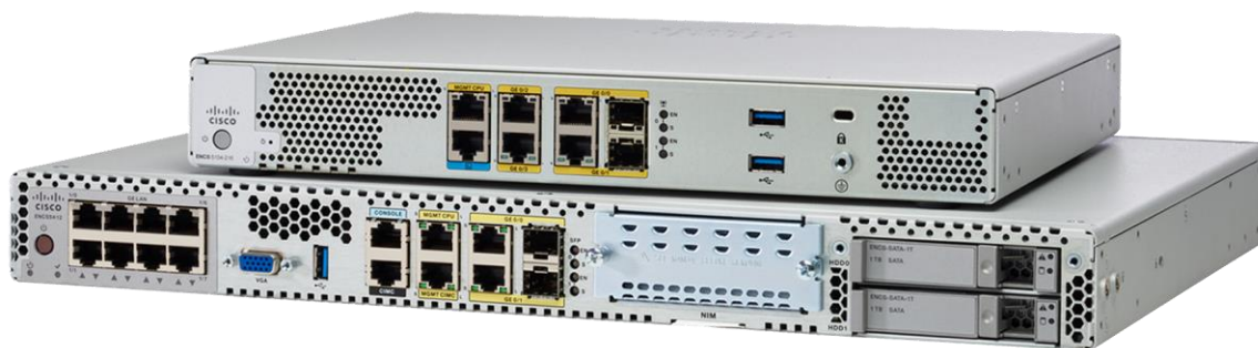
Figure 1. Cisco 5000 Enterprise Network Compute System Family

Figure 1 shows the Cisco 5000 Enterprise Network Compute System family. The Cisco 5400 ENCS (bottom) consists of three models: the 5412, 5408, and 5406. The Cisco 5100 ENCS (top) consists of one model: the 5104. It is available in three storage-capacity variants (64G, 200G, and 400G).