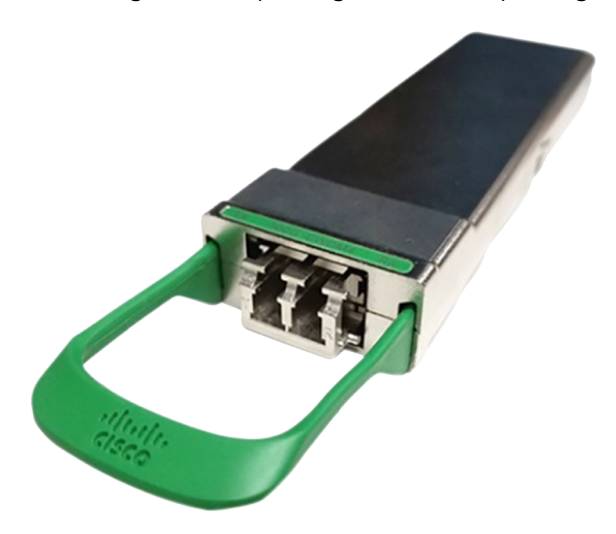
Figure 9. Cisco CPAK-100G-CWDM4 Module

The Cisco CPAK-100G-CWDM4 Module supports link lengths of up to 2 km over a standard pair of G.652 Single-Mode Fiber (SMF) with duplex LC connectors. The 100 Gigabit Ethernet signal is carried over four wavelengths. Multiplexing and demultiplexing of the four wavelengths are managed within the device.