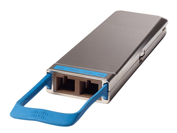
Figure 2b Cisco CPAK-100G-LR4 (Ver 08 or earlier)/CPAK-100G-LR4-2K Module with SC Connectors