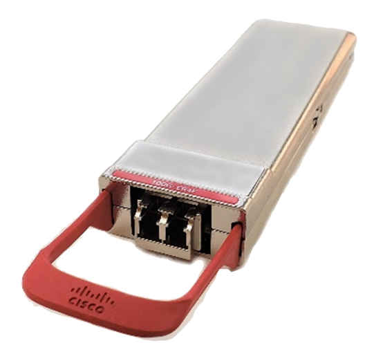
Figure 4. Cisco CPAK-100G-ER4F Module with LC connectors