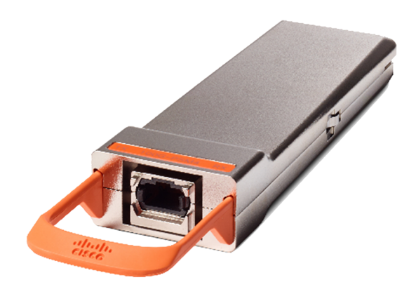
Figure 10 . Cisco CPAK-100G-PSM4 Module

The Cisco CPAK-100G-PSM4 Module supports link lengths of up to 500 meters over Single-Mode Fiber (SMF) with MPO connectors. The 100 Gigabit Ethernet signal is carried over 12-fiber parallel fiber terminated with MPO multifiber connectors.