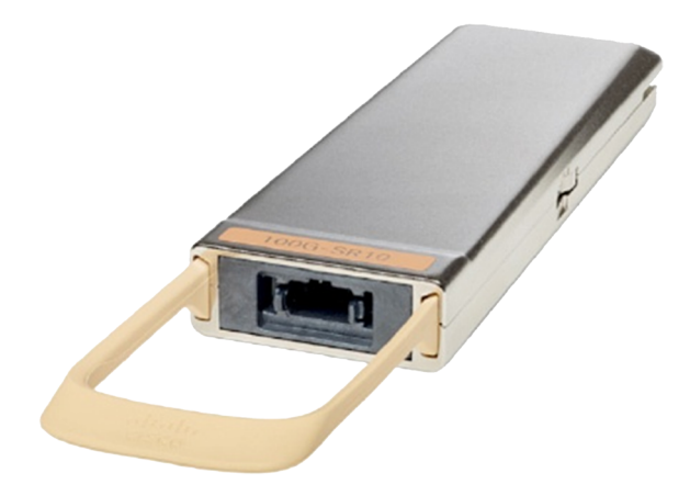
Figure 6. Cisco CPAK-100G-SR10 Module

The Cisco CPAK-100G-SR10 module delivers 100-Gbps links over 24-fiber ribbon cables terminated with MPO/MTP connectors. It can also be used in 10 x 10Gb mode along with ribbon-to-duplex-fiber breakout cables for connectivity to ten 10GBASE-SR optical interfaces. It supports link lengths of 100m and 150m on laser-optimized OM3 and OM4 multifiber cables, respectively.