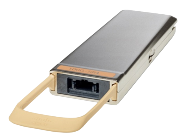
Figure 8. Cisco CPAK-100G-SR4 Module

The Cisco CPAK-100G-SR4 Module supports link lengths of up to 70m (100m) over OM3 (OM4) Multimode Fiber with MPO connectors. It primarily enables high-bandwidth 100G optical links over 12-fiber parallel fiber terminated with MPO multifiber connectors. CPAK-100GE-SR4 supports 100GBase Ethernet rate.