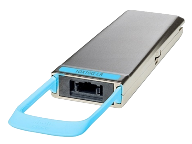
Figure 5. Cisco CPAK-10X10G-LR Module

The Cisco CPAK-10X10G-LR module is used in 10 x 10Gb mode along with ribbon-to-duplex SMF breakout cables for connectivity to ten 10GBASE-LR optical interfaces. It supports link lengths up to 10km over standard SMF, G.652. The module delivers 100-Gbps links over 24-fiber ribbon cables terminated with MPO/MTP connectors.