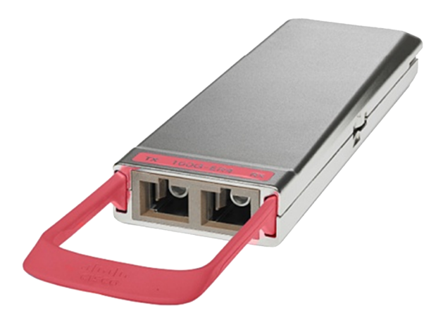
Figure 3. Cisco CPAK-100G-ER4L Module with SC connectors

These ER4 Lite modules are compatible with the 100GBASE-ER4 standard and deliver an aggregate data signal of 100 Gbps, carried over four LAN Wavelength-Division Multiplexing (WDM) wavelengths operating at a nominal 25 Gbps per lane. CPAK-100G-ER4L (no available FEC) supports link lengths up to about 25 km and CPAK-100G-ER4F supports link lengths up to about 30km with FEC disabled and 40km with FEC enabled over standard SMF, G.652. Optical multiplexing and demultiplexing of the four wavelengths are managed within the module.