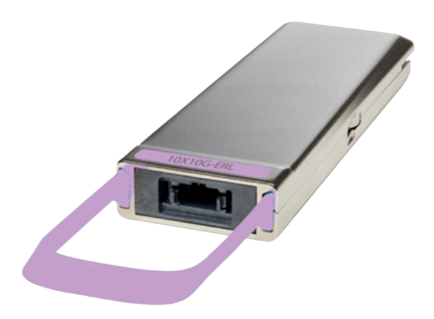
Figure 7. Cisco CPAK-10X10G-ERL Module

The Cisco CPAK-10X10G-ERL module is used in 10 x 10Gb mode along with ribbon-to-duplex SMF breakout cables for connectivity to ten 10GBASE-ER optical interfaces. It supports link lengths up to 25km over standard SMF, G.652. The module delivers 100Gbps links over 24-fiber ribbon cables terminated with MPO/MTP connectors.