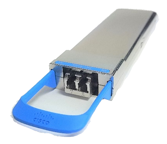
Figure 2a Cisco CPAK-100GE-LR4 and CPAK-100G-LR4 Module (Ver 09 or higher) with LC Connectors

Note: SC is the officially supported connector type.