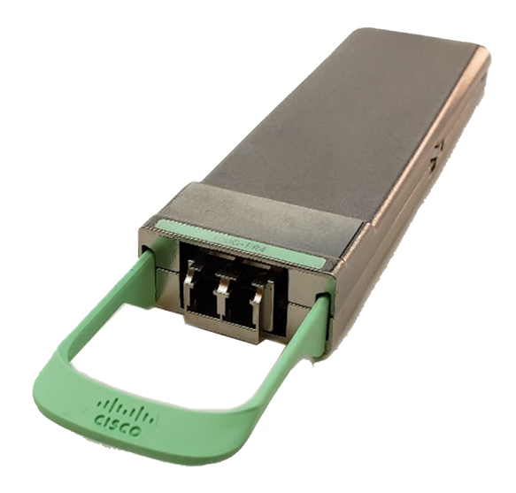
Figure 11 . Cisco CPAK-100G-FR Module

The Cisco CPAK-100G-FR Module supports link lengths of up to 2 km over a standard pair of G.652 Single-Mode Fiber (SMF) with duplex LC connectors. The 100 Gigabit Ethernet optical signal is carried over a single wavelength using a PAM4 (Pulse-Amplitude Modulation 4-Level) modulation scheme.