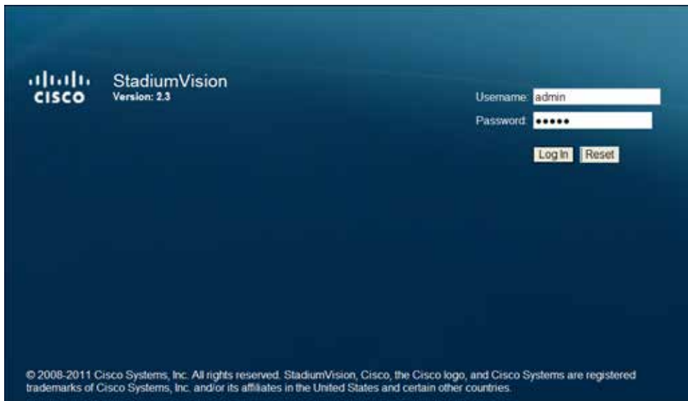
Figure 1. Logging in to SV Director

You will need to change the default password the first time you log in. The “admin” username cannot be changed or deleted.