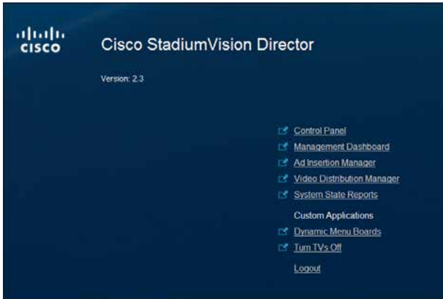
Figure 2. StadiumVision Director Main Window