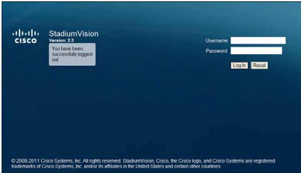
Figure 5. Logging Out of Cisco StadiumVision Director