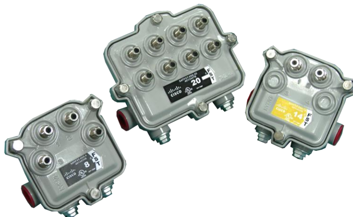
Figure 1. Cisco Flexible Solutions Taps

The Flexible Solutions Taps all have IEEE compliant 6 kV surge protection, providing significantly improved protection against voltage transients in lightning strike areas and locations with unreliable power networks. In addition, the new tap products offer the same make-before-break capabilities of previous Cisco tap products, enabling the tap faceplate to be removed without interrupting service to downstream customers. The taps pass up to 12 amps of current, enabling operators to access power at locations within the HFC plant where additional power is needed.