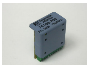
Forward Equalizers 74100