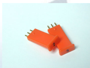
Pads (Attenuators) 77140