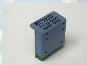
Diplex Filters 75110 Amplifiers Only