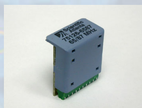
Diplex Filters 75126 Nodes Only