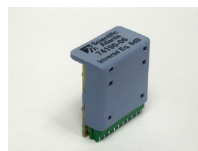
Inverse Equalizers 74190