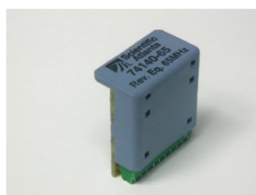
Reverse Equalizers 74140