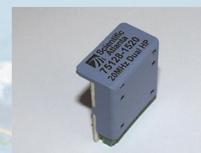
Ingress Blocking Filter 75127/75128 Nodes Only